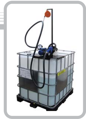
IBC not included

FRSD120801MA Basic Pump Kit, 12 VDC Rotary Vane Pump, 3/4" x 12' Hose, Auto Shut-Off Nozzle, Digital Meter